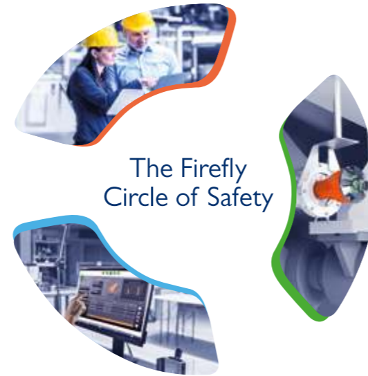
The Firefly Circle of Safety

Fire prevention and protection through certified technology.